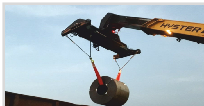
Steel coils being loaded in a train to Dhamra Port

of first rack from Tata Steel's Kalinganagar plant. 6,000 MT of steel coil was received in the first phase.