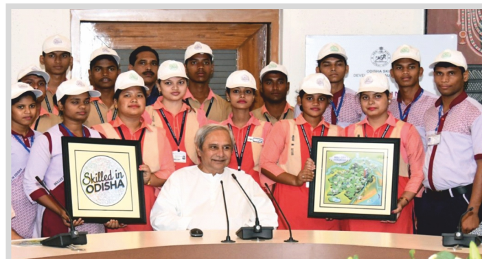
Hon'ble CM Shri Naveen Patnaik at the unveiling of the logo for Skilled in Odisha

In line with its vision of making 'Odisha's Best, World's Next', the State organized Odisha Skills 2018, a first-of-its-kind state-level skills competition last month.