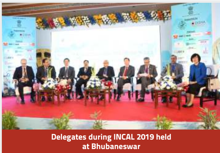
Delegates during INCAL 2019 held at Bhubaneswar

The 3-day mega aluminium conference - International Conference on Aluminium (INCAL-2019) was inaugurated on January 31, 2019 at Bhubaneswar. INCAL-2019 showcased the latest technologies and advancements in the sector. More than 850 delegates, including 150 foreign delegates from 20 countries participated in the event. The State Government showcased the business ecosystem in the State for the sector and held one-to-one B2G meetings with select potential investors.