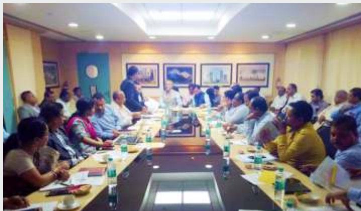
'Industry Care' meeting with representatives of Khordha based industries

The Industries Department, has launched a district-wise formal engagement initiative named as "Industry Care" to raise awareness about business reforms implemented by the State and address issues/grievances faced by the industrial units. The 2 nd meeting under 'Industry Care' initiative was held with representatives of Khordha based industries on January 16, 2019.