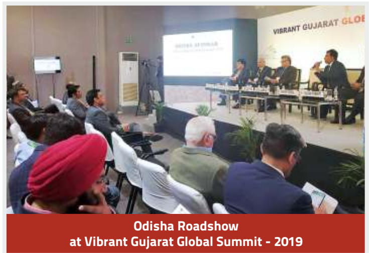
Odisha Roadshow at Vibrant Gujarat Global Summit - 2019

The Odisha government showcased its investment opportunities at a roadshow during the 'Vibrant Gujarat Global Summit - 2019' held at Gandhinagar on January 20, 2019. 116 investors attended the investors meet to learn about the investment opportunities in Odisha across focus sectors. The Government delegation also held one-to-one meetings with interested investors during the event.