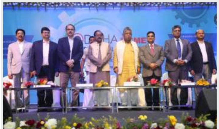
Hon'ble Finance, Excise & Agriculture & FE Minister, Shri Sashi Bhusan Behera and other dignitaries during the International MSME Trade Fair, 2019

Hon'ble Finance, Excise and Agriculture & Farmers Empowerment Minister, Shri Sashi Bhusan Behera, inaugurated the International MSME Trade Fair on January 28, 2019 at Bhubaneswar. As many as 400 MSMEs, 40 Start-ups and 32 entrepreneurs from 4 countries namely Iran, Bangladesh, South Korea and Cambodia participated in the Trade Fair.