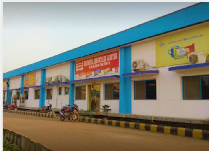
Manufacturing Unit of BIL at Khordha

According to the company officials, the proactive and supportive policies and the incentives offered by the State Government have attracted the Company to set up their manufacturing unit in the State.