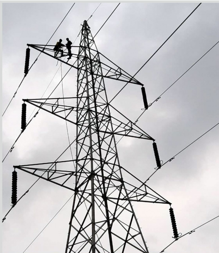
Tower re-erection at Chandaka