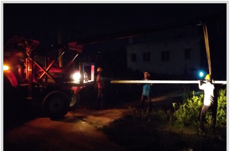
Pole erection and restoration work at Sakhigopal