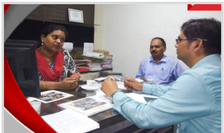
Interaction during District visit

Various nodal officers and officials from IPICOL visited various districts of the State to disseminate information regarding the business reforms undertaken by various state Government departments and the institutional framework set in place to provide aftercare services to the investors.