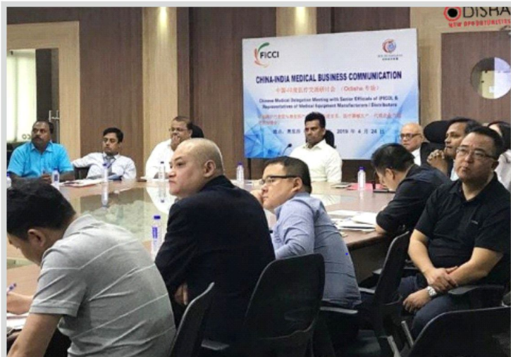
Meeting with visiting delegation from China at Bhubaneswar

A delegation of manufacturers of medical equipment from China visited Odisha to explore investment and trade prospects in the state. Managing Director, IPICOL briefed the delegation about the investment opportunities in the State. He also highlighted the focus of the State Government towards developing a robust medical and healthcare ecosystem in the State.