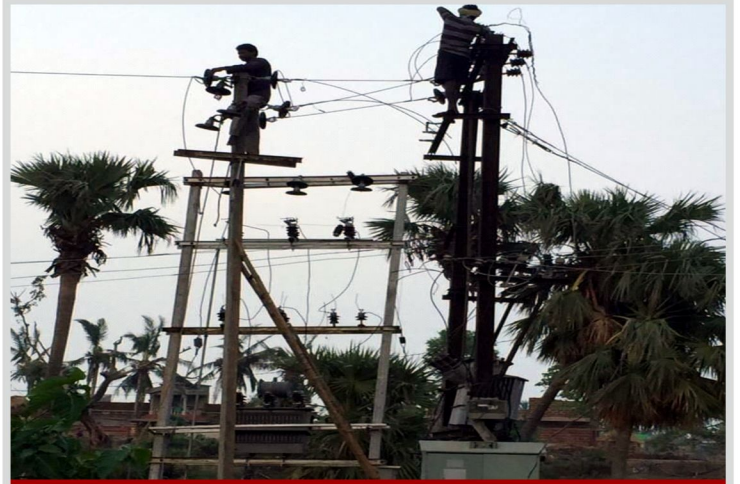
Restoration work at Nirakarpur-1 feeder