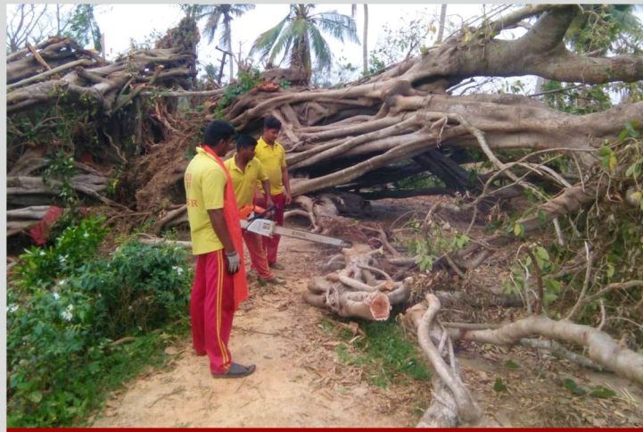
Cutting of trees at Sarpada GP