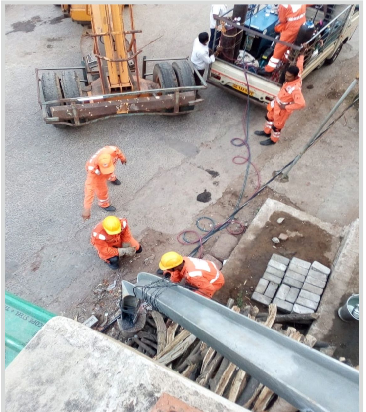
NDRF team at work in Puri