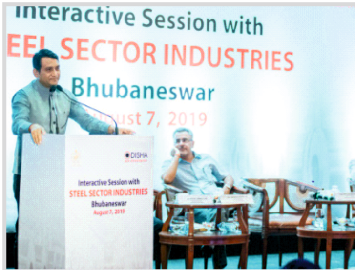
Hon'ble Minister, Industries addressing the session with Steel Sector Industries