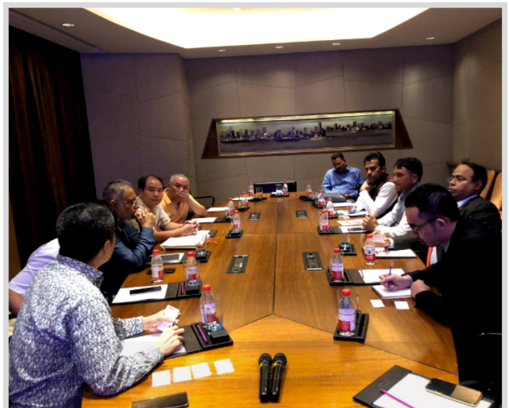
Hon'ble Minister, Industries led delegation meeting companies at China