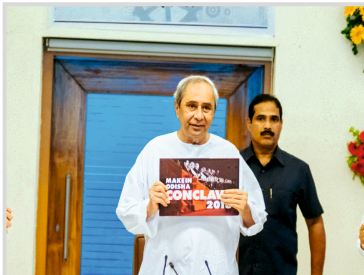
Hon'ble Chief Minister launching the MIO Conclave 2018 Coffee table book

An interactive meet was held with the prominent steel manufacturers of the State to discuss the vision of achieving 100 MTPA capacity for steel production in Odisha by 2030 and establishing Odisha as a Global Steel Hub. The meet was attended by more than 60 steel manufacturers in the state.